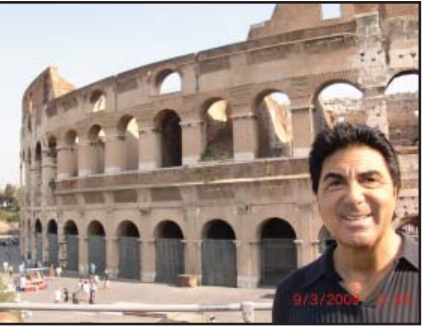
nis in Roi