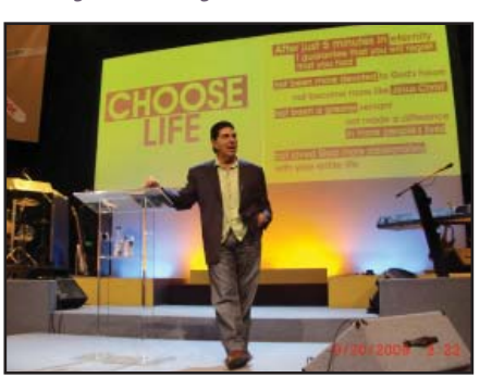
Ministering @ River Dream Centre, Exeter, Uk

were literally having demons cast out of them, others accepted Christ and some people needed prayer for their families to be restored. I could not wait to share my testimony and share how Christ could transform your life and give you strength to serve Him.