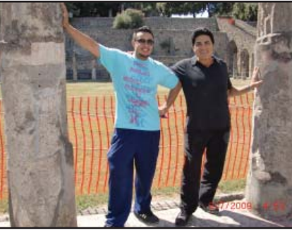
Breaking Down Strongh