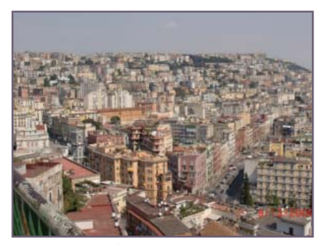
Praying Over Naples

be a great latter-rain outpouring of the Holy Spirit that would bring a great spiritual awakening throughout Europe that would break the spirit of idolatry that is such a stronghold throughout Italy and Europe. A couple who were pastors in Italy said twenty-five years ago I prophesied in a church in Long Island that they would go back to Italy and establish a great church there. Praise God it came to pass and I had an opportunity to meet these humble servants.